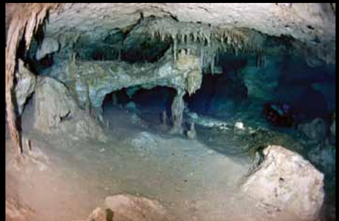
Cenote Chan Hol